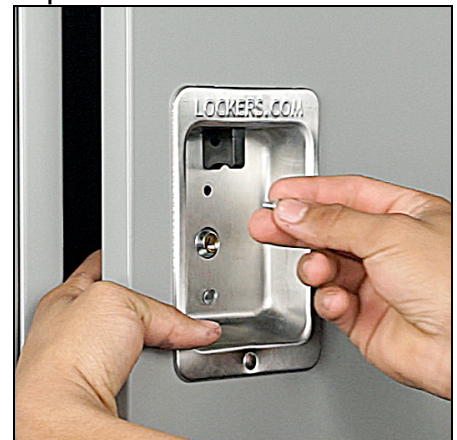
With one hand, hold the case assembly in place. With the other hand, insert the screws through the front of the hasp, continuing through the holes of the case assembly.