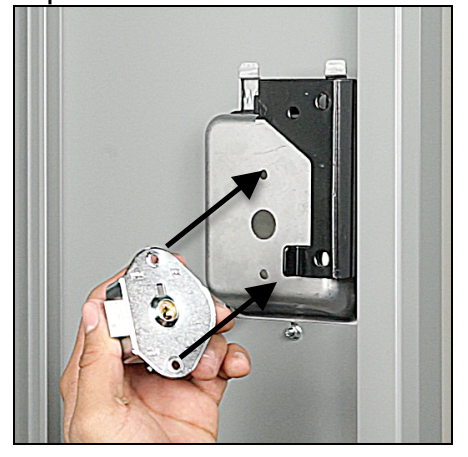
Align the two holes on the case assembly with the two holes on the hasp.