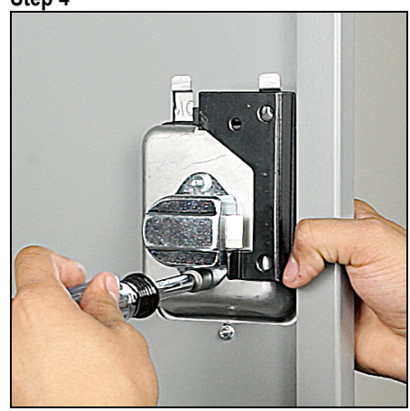
Place locking nuts on screw bolts and tighten. Lock is now ready to operate. WARNING: If electric socket wrench is used, do not exert excessive pressure.