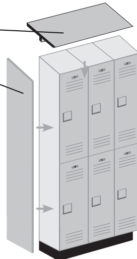
(Double Tier Displayed)

Each triple tier compartment is 10-1/2" W x 23" H x 17" D.