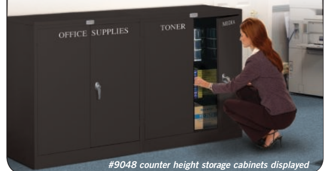
#9048 counter height storage cabinets displayed

Constructed of 20 gauge steel, Salsbury counter height storage cabinets (#9048) offer versatile applications and are ideal for offices, garages, institutions and schools. Measuring 36" wide, 42" high and 18" deep, the two (2) door storage cabinets are available in a gray, tan or black powder coated finish. Counter height storage cabinets are 18" deep and include two (2) adjustable shelves that can accommodate contents up to 180 pounds per shelf evenly distributed. Counter height storage cabinets feature two (2) 17" wide doors and a 6" steel handle with a built-in three (3) point locking mechanism with two (2) keys.