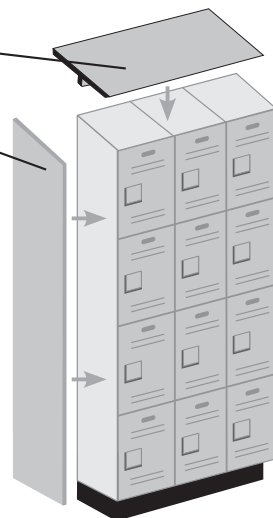
(Four Tier Displayed)

All lockers are 12" wide and locker doors include a stainless steel hasp for locking - padlocks (#44420 for combination and #44425 for key) are available as an option upon request.