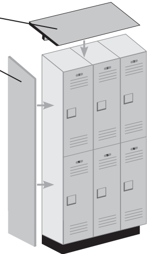
(Double Tier Displayed)

Each four tier compartment is 13-1/2" W x 17" H x 17" D.