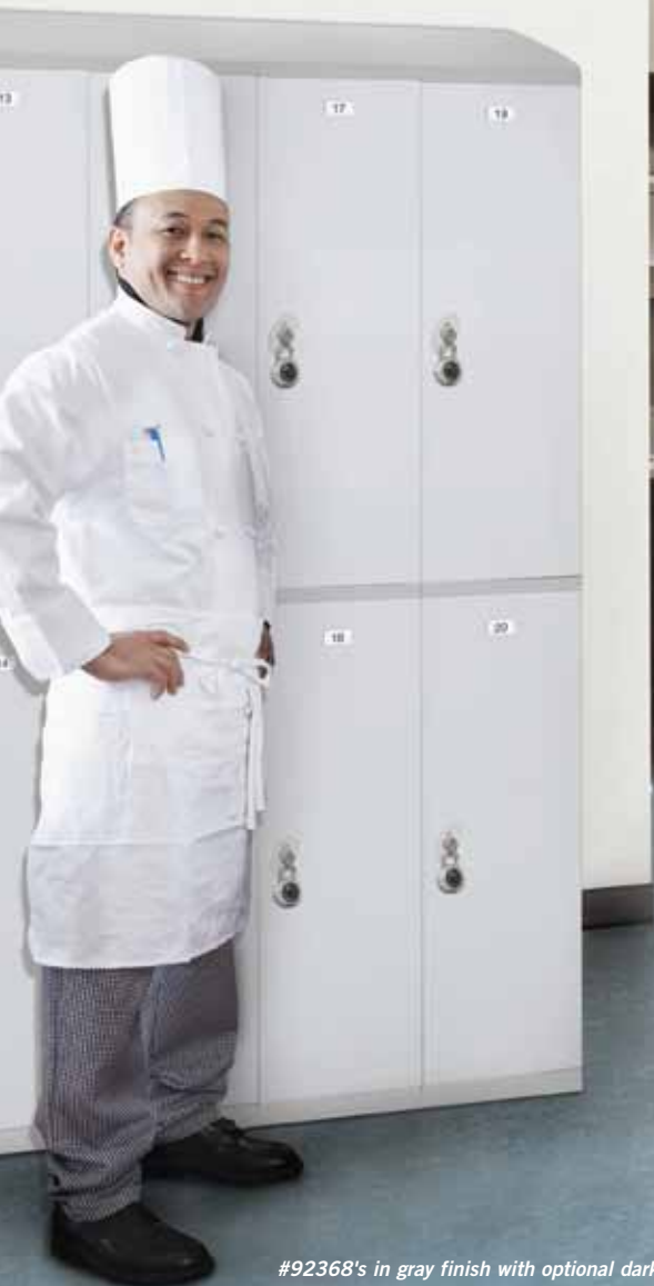
#92368's in gray finish with optional dark gray sloping hoods (#99953), combination padlocks (#99920) and custom engraved placards (#99960) displayed