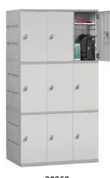
93368 (Shown with optional shelf #99998)