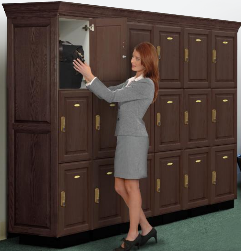
#13361's with optional solid oak crown molding (#11156), raised side panels (#11135), electronic locks (#11190) and engraved name / number plates (#11160) displayed