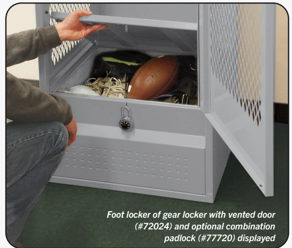
Foot locker of gear locker with vented door (#72024) and optional combination padlock (#77720) displayed

Note: Built-in locks are pre-installed on assembled lockers.